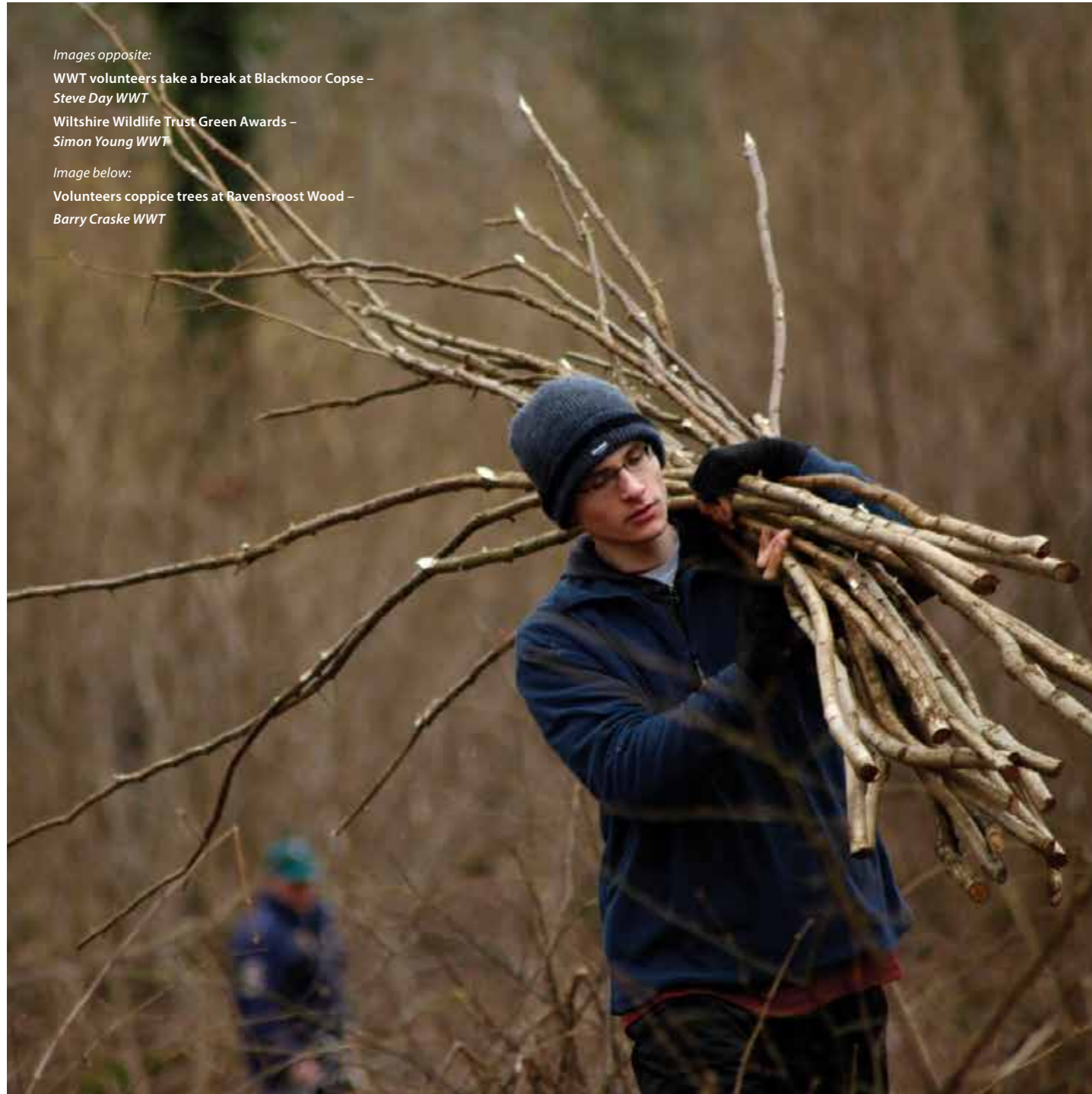
Image below: Volunteers coppice trees at Ravensroost Wood

Images opposite: WWT volunteers take a break at Blackmoor Copse Wiltshire Wildlife Trust Green Awards