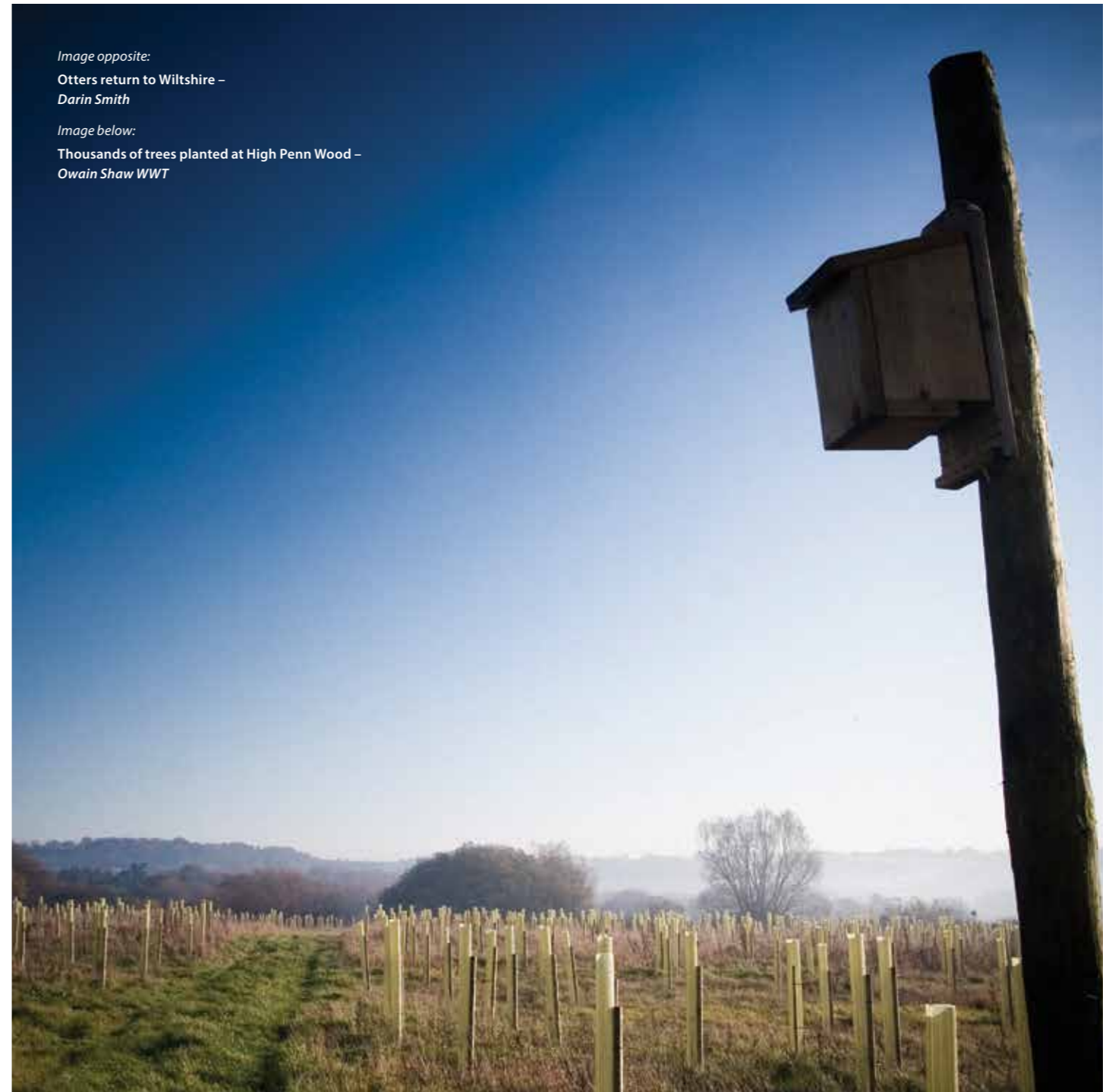
Image below: Thousands of trees planted at High Penn Wood