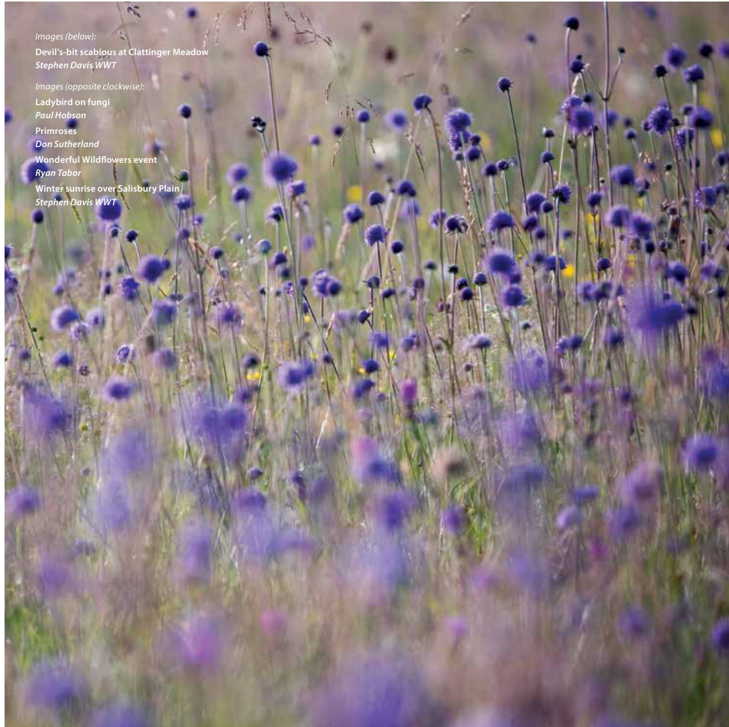
Images (below): Devil's-bit scabious at Clattinger Meadow