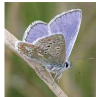
Images (clockwise): Pond dipping at Smallbrook Meadows Starlings over Rivermead Winter robin Common blue male butterfly